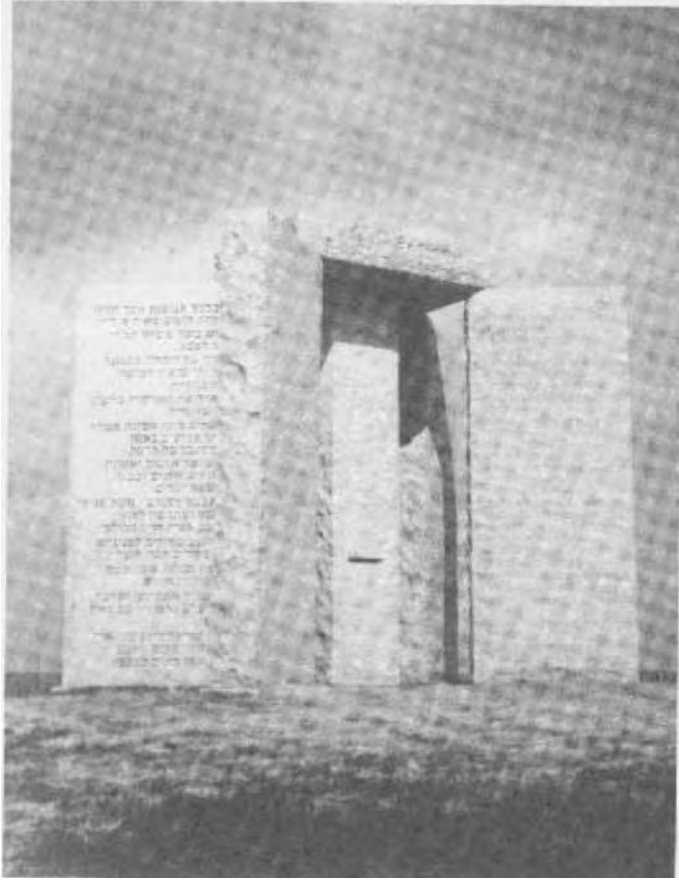
The Georgia Guidestones